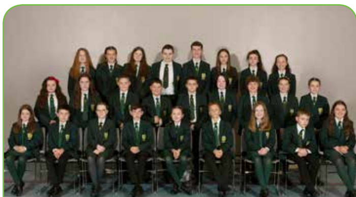
St. Joseph's Grammar School Donaghmore Class 8P