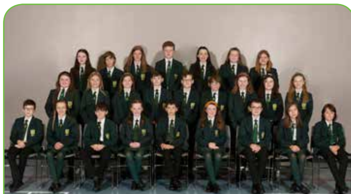
St. Joseph's Grammar School Donaghmore Class 8J