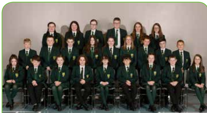
St. Joseph's Grammar School Donaghmore Class 8H