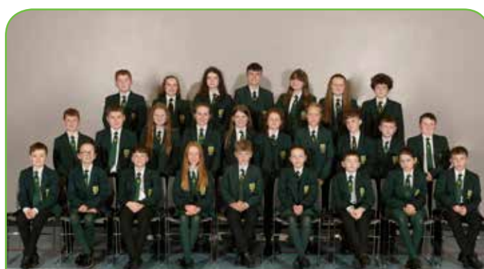
St. Joseph's Grammar School Donaghmore Class 8X