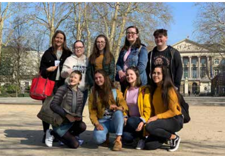
Belgium - September 2018