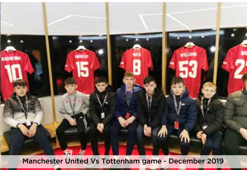
Manchester United Vs Tottenham game - December 2019