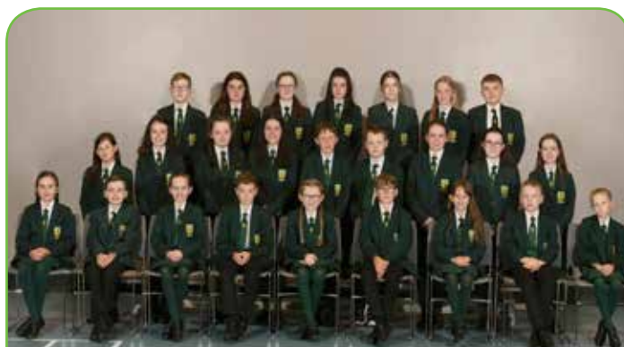
St. Joseph's Grammar School Donaghmore Class 8S