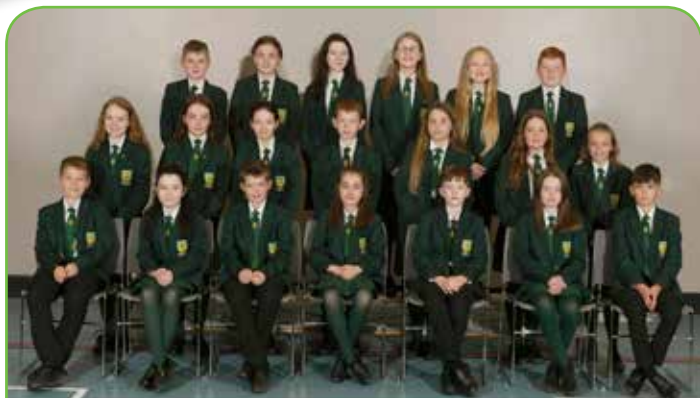
St. Joseph's Grammar School Donaghmore Class 8G