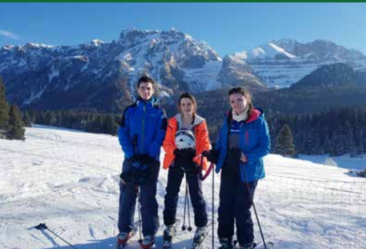
Ski Trip Italy - January 2019