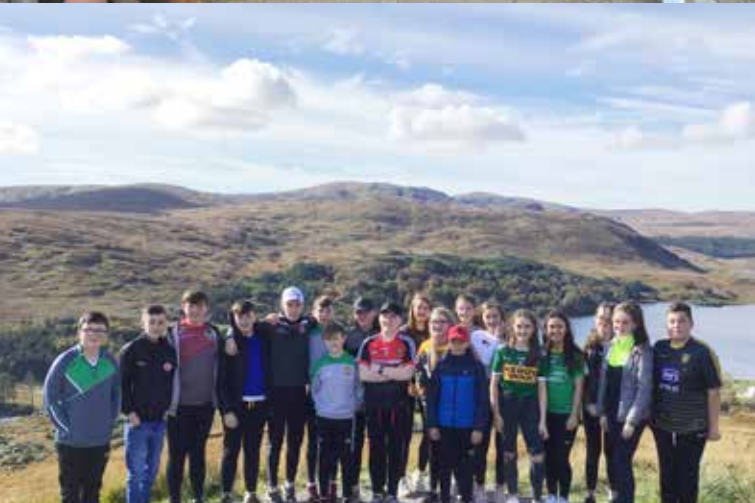
Donegal - Summer 2019