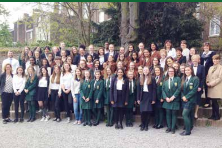
Belgium - September 2018