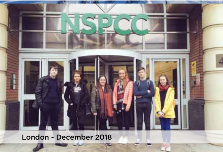
London - December 2018