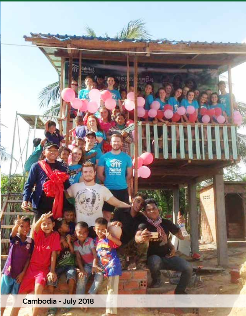
Cambodia - July 2018