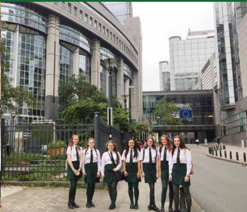
Brussels - June 2018