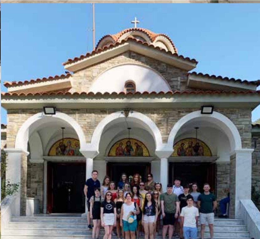
Athens - October 2019