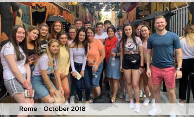
Rome - October 2018