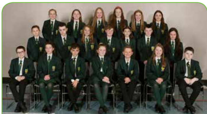
St. Joseph's Grammar School Donaghmore Class 8I